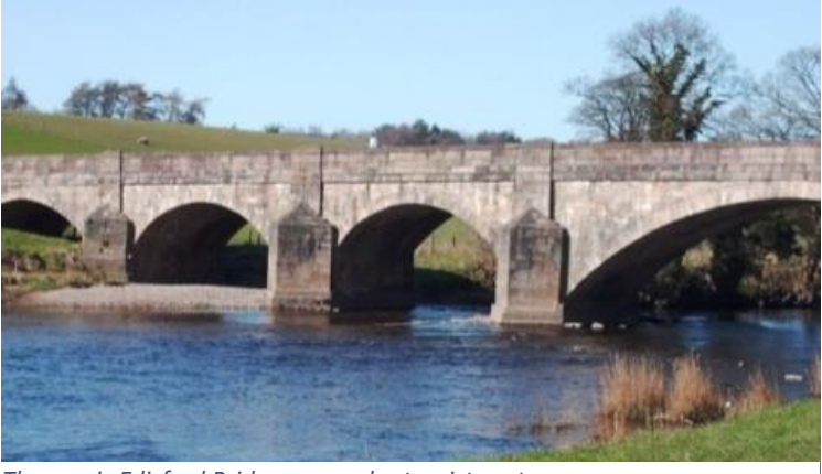
The scenic Edisford Bridge: a popular tourist spot