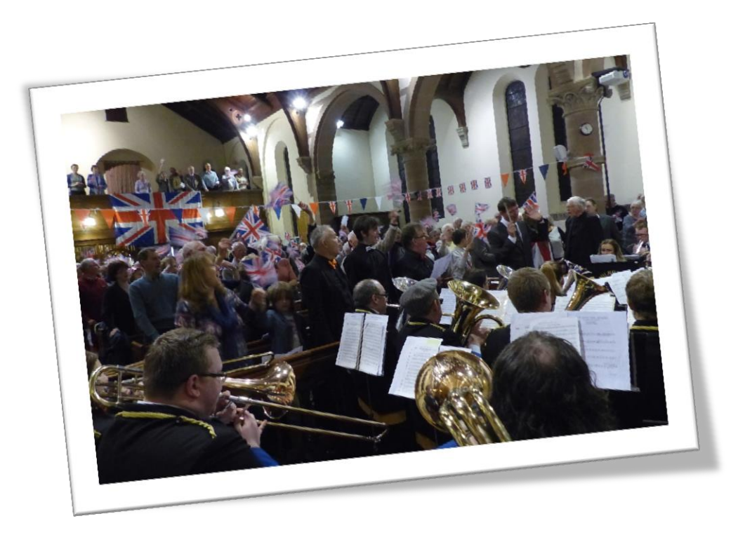
Last Night of the Proms - part of our annual calendar of musical events

There is a parish pastoral assistant who helps with visiting the sick and baptism families. There were 11 funerals in 2016 (including 4 burials in the churchyard). There were 2 weddings and 5 baptisms.