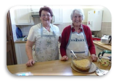
Our new kitchen

Christ Church is a very well-maintained Victorian building – in fact since the foundation stone was laid 4 days into Victoria's reign it can claim to be the oldest Victorian church. It is next to an outstanding church primary school