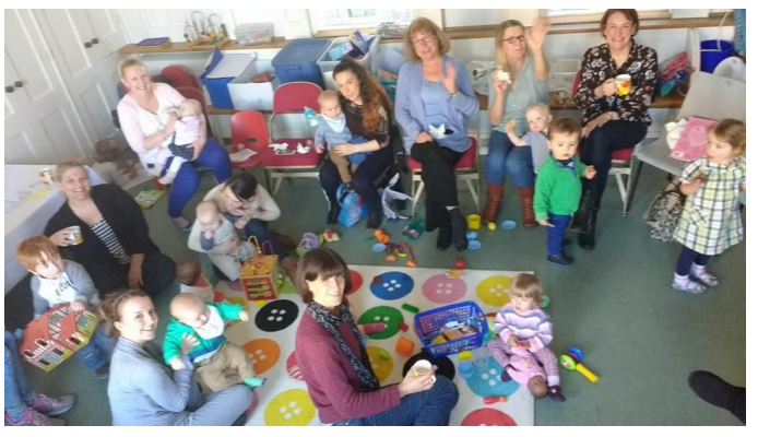
Childrens Church meets midweek every week at St Marys

the prayer network and the Vision 2026 prayer group. We have strong links with the two community primary schools, grammar school and a private school which all lie within the parish boundary. Our Vicar is also the part-time Chaplain for the local community hospital and our lay assistants visit the local residential care homes and housebound to administer communion.