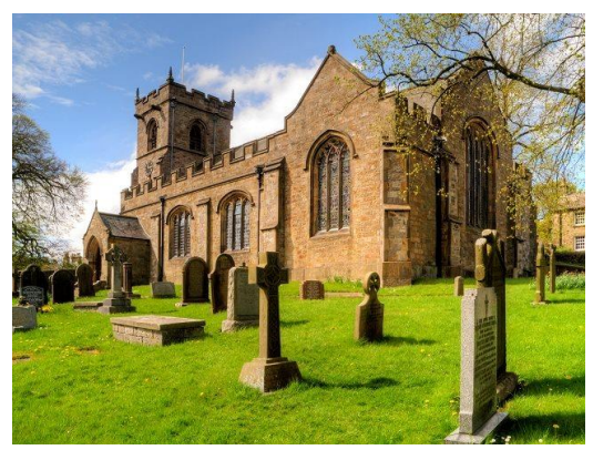
St Leonards Church Downham

St Leonard's is a friendly traditional village church which values the Book of Common Prayer. There are between 10 - 25 regular worshippers at our main Sunday morning worship at 11 am with larger numbers on festival Sundays. The clergy use either cassocks and surplices or an alb and stole. We have a small but very accomplished robed choir and a new organ.