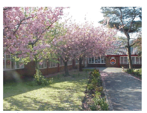
Edisford Community School, opposite St Pauls

The village of Low Moor has a cenotaph dedicated to those lost during WW1 and WW2. We hold an annual service on Remembrance Day and the incumbent is expected to host this. This is a very popular event attended by veterans and supported by our uniformed organisations.